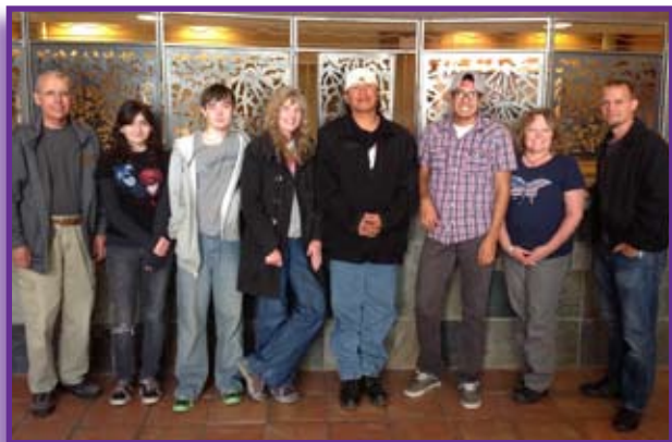
Seminar attendees in Durango, CO

+ USA: You supported our first comics event for Native Americans (and ministry workers who serve them) in Durango, CO, which we held in partnership with Christ for Native Youth and Western Indian Ministries!