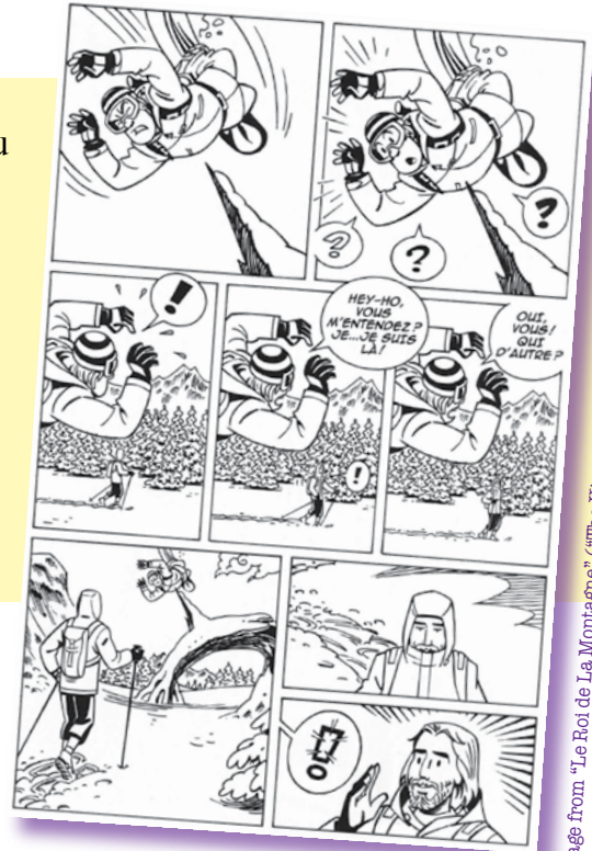
Page from "Le Roi de la Montagne" ("The King of the Mountain")

PRAISE GOD WITH US! He is doing wondrous things. Your support reaches French-speaking Africans, the Québécois, Eastern Europeans, US prison inmates, and so many people around the world! You're a valuable part of this ministry. We need you!